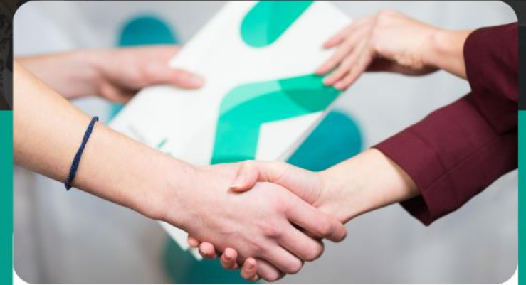
Collaboration with business