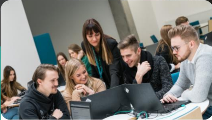
Integration into the study process